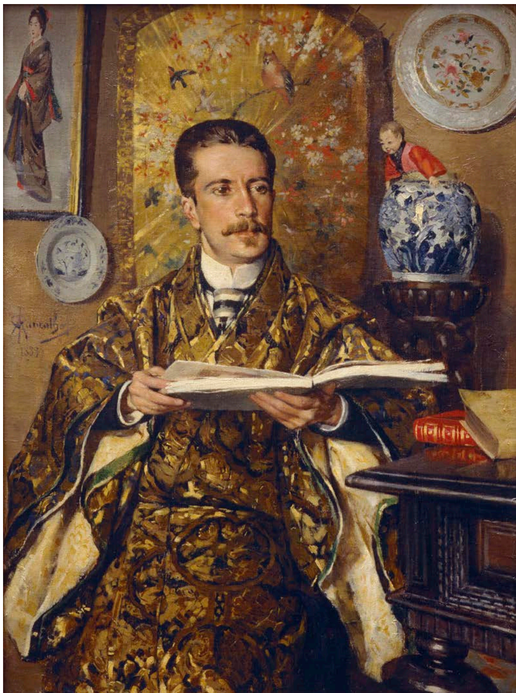
Figure 2. António Ramalho, Retrato de Abel Botelho , 1889, Oil on Canvas, 59 x 44 cm. Museu Nacional de Arte Contemporânea – Museu do Chiado, Lisbon