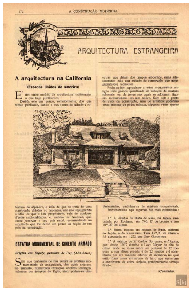
Figure 5. Article “A Arquitectura na California (Estados Unidos da America)” Published in “A Construção Moderna” in November 25, 1916.