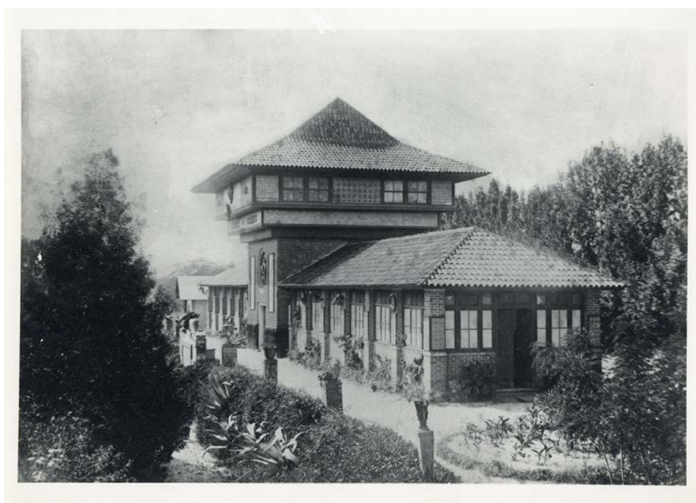
Figure 1. Raphael Bordallo Pinheiro, Sales Pavilion of the Caldas da Rainha Faience Factory, Caldas da Rainha, Portugal, 1885 (photograph by unknown author, c. 1889)

Diametrically opposed to what happened in France, the United Kingdom and the USA, Portugal's difficulty in sustaining well-defined relations with Japan was reflected in a certain disaffection of the Portuguese artistic milieu from Japanese art. This disaffection was even greater when one took architecture into consideration. The ambience of a possible Japanese influence that resulted from the application of the silks and other pieces gifted by the Japanese mission of 1862 in one of the rooms of the Palace of Ajuda, in Lisbon, is significant for being unusual, not so much for reflecting a general adherence to Japonisme . The sales pavilion of the Caldas da Rainha Faience Factory, with its clear references to Japanese architecture, was an exception (Figure 1). It was most likely designed by Raphael Bordallo Pinheiro (1846-1905), an illustrator, sculptor and ceramicist, who was the owner of the factory. The pavilion was completed in 1885. 16