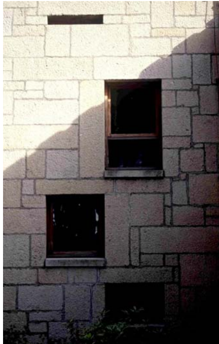
Fig. 3. Oliveira do Hospital Pousada, windows on the Southwest façade. Photo by João Belo Rodeia, 1995

small-sized span obtained by means of perforation of the granite walls should be “governed by the power of traction of the granite” (Tainha, 1956: 3, our trans.). Furthermore, the use of the Modulor would seem to deviate from the desire to achieve a bond to the location and the desire for a certain revision of the Modern Movement, which marked the pousada’s design.