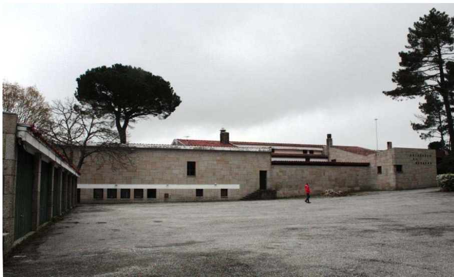
Fig. 1. Oliveira do Hospital Pousada, Northwest façade. Photo by the authors, 2012