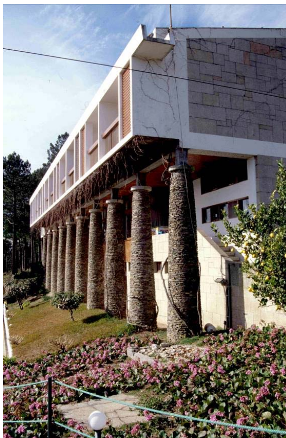
Fig. 2. Oliveira do Hospital Pousada, Southeast façade. Photo by João Belo Rodeia, 1995